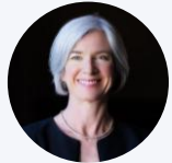
Dr. Jennifer Doudna

Our speakers reinforce the program's connection to world-class innovation leadership.